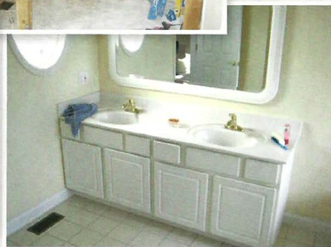
The bathroom before and during the renovation.